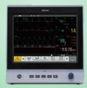
X12 Patient Monitor